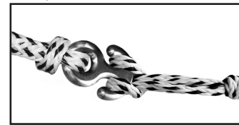
Step 4: Pull the rope tight