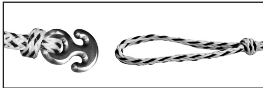
Step 1: Find the loop on the end of your tow rope

Using the aluminum quick connect system allows you to very quickly and easily hook a tow rope to the tow system on the tube. Follow the instructions below to properly attach the tow rope when using this system.