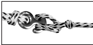
Step 3: Slide the loops made in step two over the ends of the aluminum quick connect