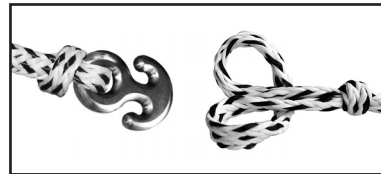
Step 2: Pull the end of loop under itself, back towards the knot